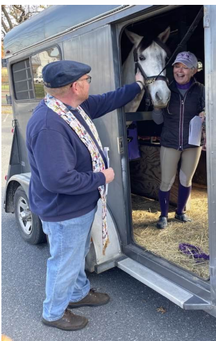
The Blessing of Pets